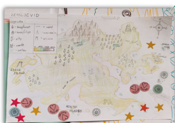
Student design (SLO)

One of the most exciting happenings of the last few months in the me_HeLi-D project has been the realization of the various student ideas from the design workshops (June 2023) by the amazing Slovenian designer Monika Klobčar . After many months of sketching and iterating, the designs were finalized and digitalized. Great care was taken to ensure that they closely followed the students' original ideas, but also resulted in a well-rounded and coherent overall design. Two examples of how the Landscape of a Mind and the buddy character HeLi, the Crow , were realized are shown below.